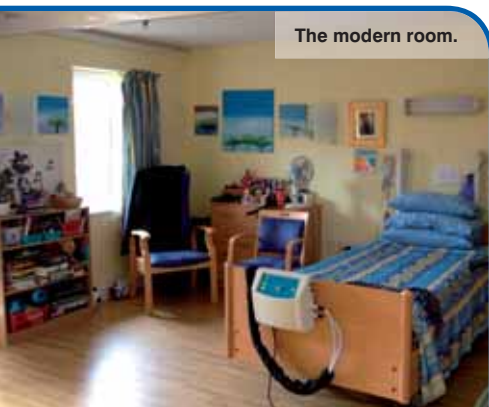
The modern room.

*Lord Roberts Memorial Workshops was an organisation set up to create employment for wounded ex-Servicemen .